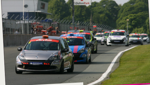
Dixon controlled tight first race